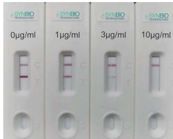
Test card color rendering display diagram